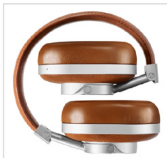
FOLDS FOR STORAGE