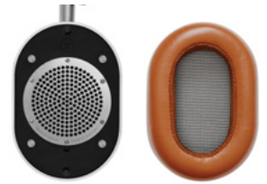
Laser Etched Earcup Ear Pad