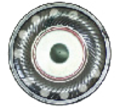
45mm Custom Neodymium Drivers