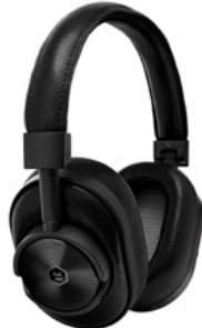
MW60 WIRELESS OVER EAR HEADPHONES MODEL NO. MW60B1 Black Metal / Black Leather