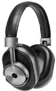
MW60 WIRELESS OVER EAR HEADPHONES MODEL NO. MW60G1 Gunmetal / Black Leather